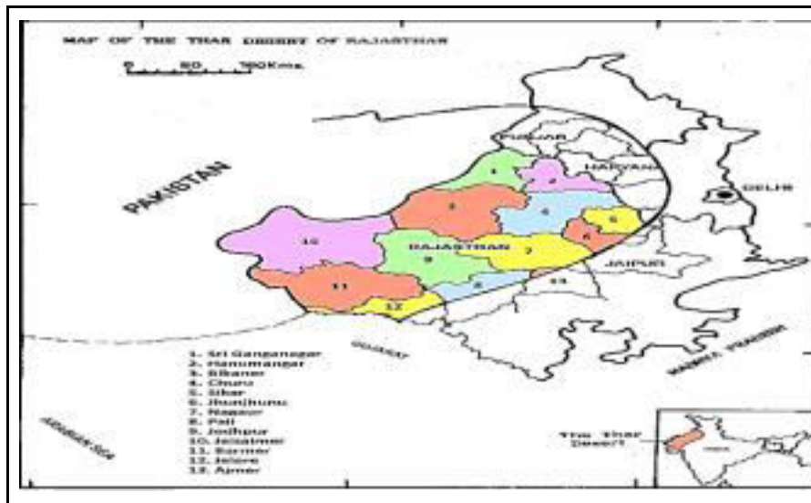
Fig.: Map of the study area

Rajasthan is located in northwestern India, between 23°30' and 30°11' North latitude and between 69°29' and 78°17' East longitude, and covers an area of 342,239 sq. km. Almost diagonally, the Aravalli chain divides Rajasthan into its two climatic zones viz., the arid zone i.e., the Thar Desert in the west and the semi-arid to sub-humid zone in the east and southeast of Rajasthan. The present study only focused on the Thar Desert of Rajasthan which covers almost 13 districts out of 33 districts of the state (Ghosh et al., 1996).