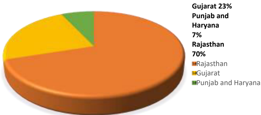
Fig.: Distribution of the Indian Thar Desert

The present study on the butterfly diversity in the Thar Desert of Rajasthan includes a thorough checklist of butterflies from Rajasthan's Thar Desert, incorporating species found in the databases of the Zoological Survey of India (ZSI), Desert Regional Centre (DRC), Jodhpur, and species that have already been documented in the published literature.